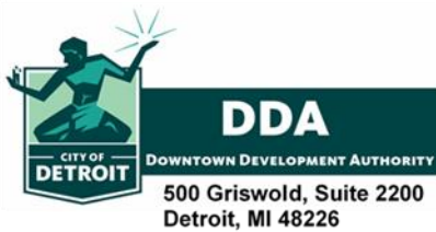
EXHIBIT A Proposed Terms