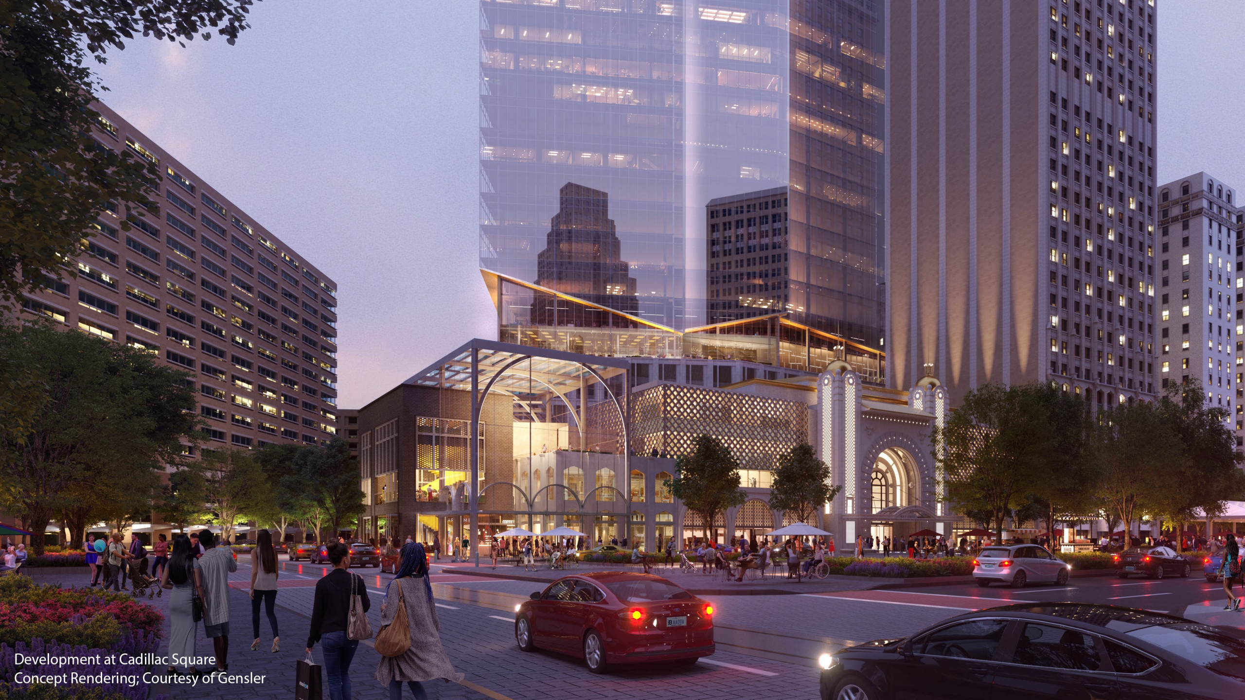
Development at Cadillac Square Concept Rendering; Courtesy of Gensler